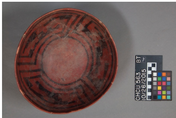
Figure 3 Interior of vessel CHCU 563 viewed from above

The examination of CHCU 563 (Figures 3 and 4), a spherical bowl created from red earthenware and painted with black mineral pigment, shows extensive fills from the previous reconstruction and some of those materials were applied over the surface of original ceramic sherds. These materials can be observed in Figure 4 as lighter areas of reddish brown next to the original ceramic and as small dots across the surfaces.