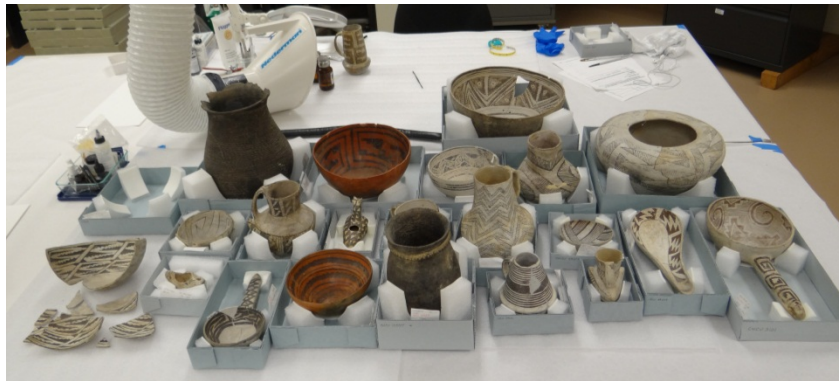
Figure 1 Ceramic vessels from CHCU currently undergoing examination

Funded through the National Park Foundation