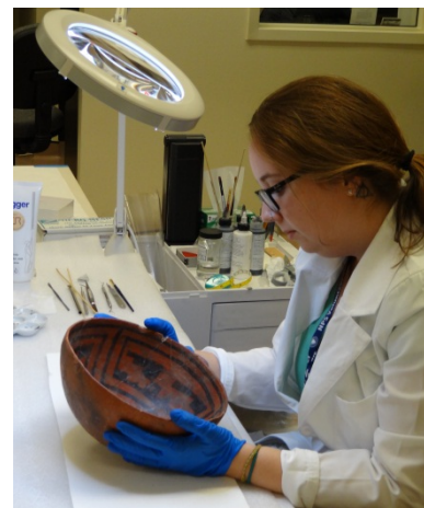
Figure 2 Examining CHCU 563

This group of vessels is currently undergoing examination and photography prior to proposing treatment to the curator. The conservator takes a long slow look at the object, learning about the creation of the object and past repairs. In the case of these vessels the conservators are looking at the characteristics and the stability of the ceramic body and the previous reconstruction adhesives and fills. This information guides the conservator in describing the condition of the object and proposing conservation treatment steps to address instabilities